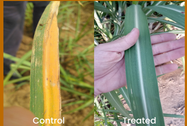
Resistance to insects