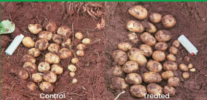
Increased yield and more even size distribution